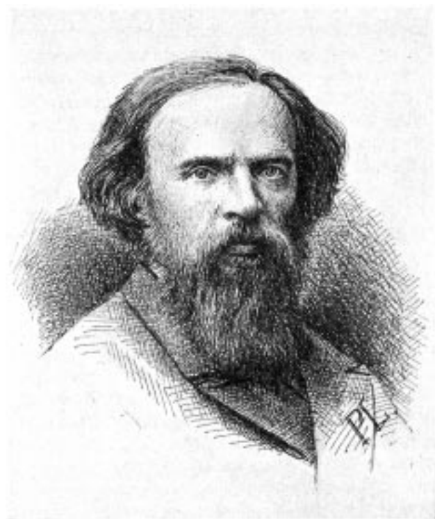
D I Mendeleev