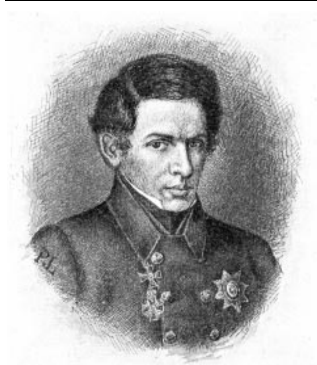
N I Lobachevskii