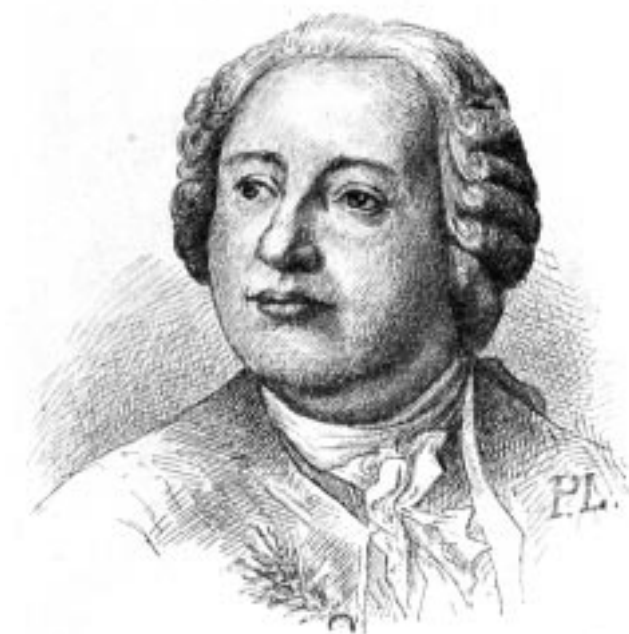
M V Lomonosov

useful applications of mathematics in various branches of technology and public affairs. Worthy of special note are his remarkable studies on the theories of ship building, vibration, elasticity, hydraulic turbines, etc. Euler was the head of the Russian mathematical school. It is known that young mathematicians, his students and assistants, helped Euler in his work on the theory of lunar motion.