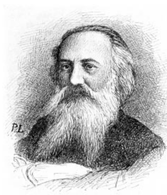
E S Fedorov

time. There is little doubt that the advanced character of his findings was the main reason for which they were not immediately recognized at their true worth by contemporaries 8 .