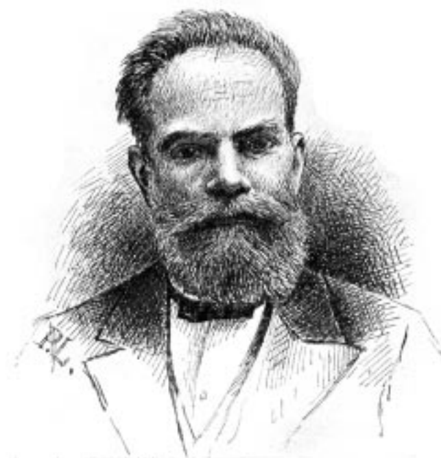
A M Lyapunov

development of the nation. A large number of teachers, engineers, specialists in medicine and law were educated at institutions of higher learning formed on the model of the Moscow University founded by M V Lomonosov. A large number of investigations during this second period were accomplished in university laboratories which also served as research-study schools for young scientists.