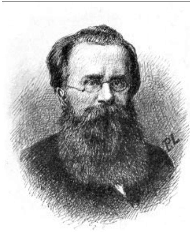
A O Kovalevskii

A M Butlerov was a pioneer of structural research in organic chemistry. His ideas of molecular structure and the interrelationship of atomic bonds were further developed in the works of his numerous pupils. N N Zinin, E E Vagner, N A Menshutkin, V V Markovnikov, L A Chugaev, and some others conducted and published studies which made them classical authors in organic chemistry.