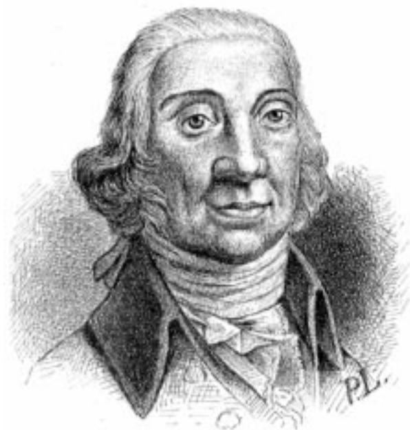
P S Pallas