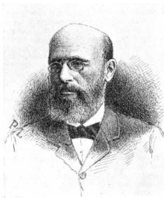
A M Butlerov

“Definition 52. Physical bodies can be divided into the smallest units invisible to the naked eye; in other words, these bodies consist of non-identifiable physical particles.