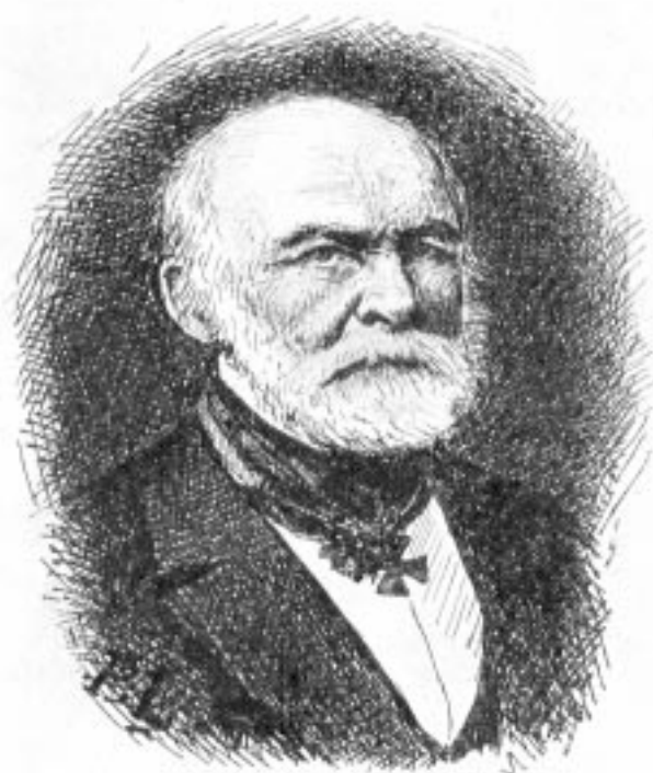
N I Pirogov