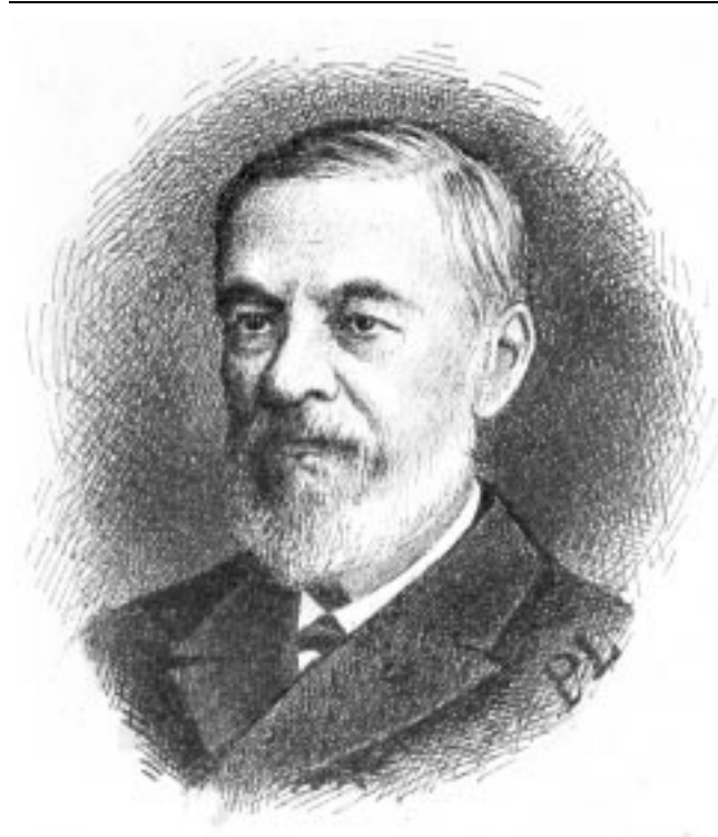
I M Sechenov

The supreme achievements of Russian scientists in physics and chemistry were paralleled by just as impressive progress in biological sciences. Russian biologists made a series of fundamental discoveries of primary importance for the