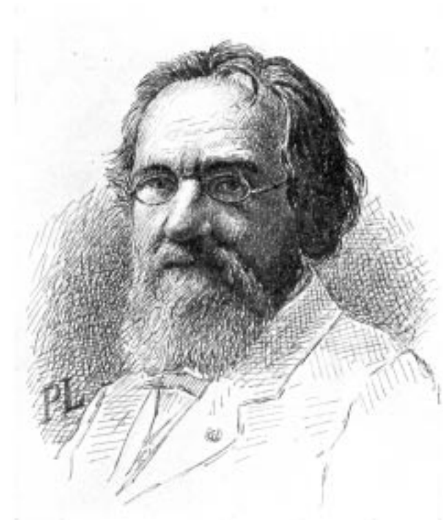
I I Mechnikov

We have already mentioned that the foundation of the modern physico-chemical theory was laid by M V Lomonosov. Now, it is worthwhile to note that thermochemistry owes as much to the classical works of G H Hess while E I Parrot carried out an in-depth study of the mechanisms of diffusion and left a detailed and precise description of this phenomenon which is considered to be a most valuable contribution to physical chemistry.