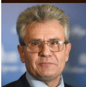
Alexander Sergeev (Russia, Co-chair) President of the Russian Academy of Sciences